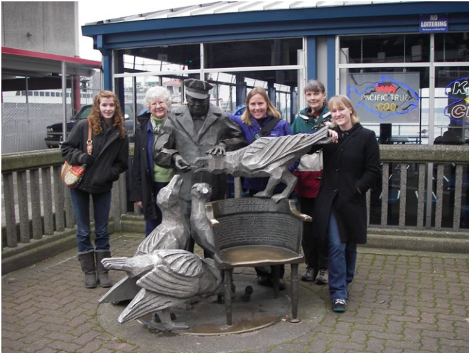
Ivar's 107th anniversary

V O L U N T E E R N E W S L E T T E R - M A R C H 2 0 1 2