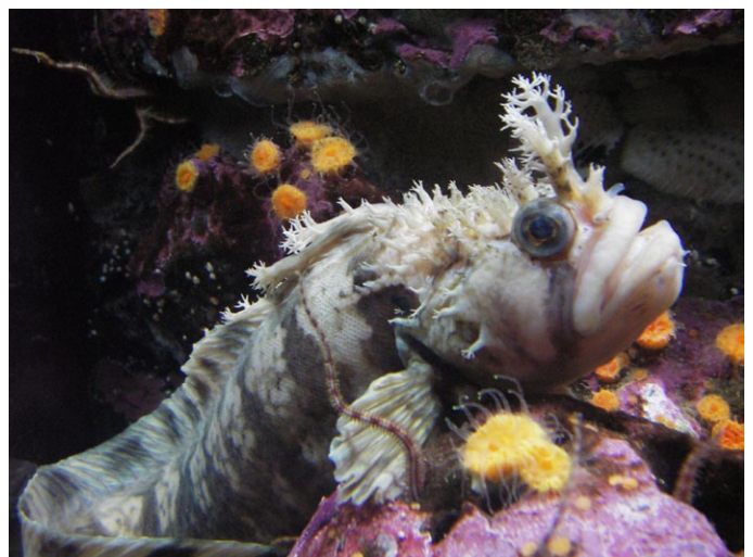
Decorated Warbonnet ( Chirolophis decorates )