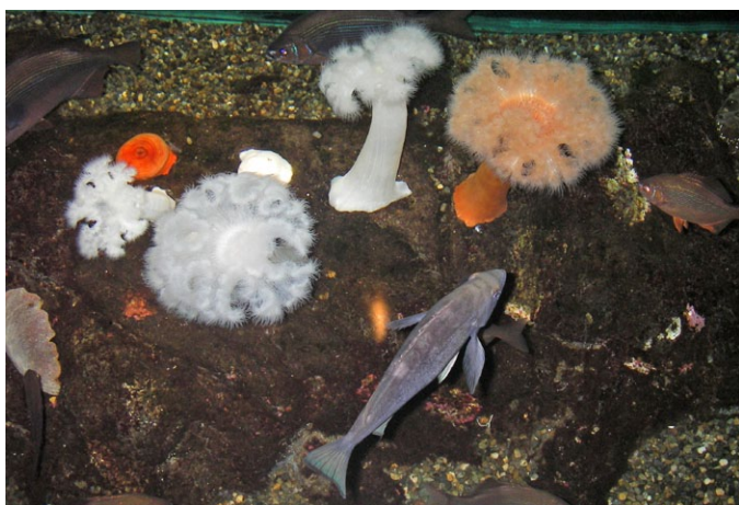
Fish and anemones

The Seattle Aquarium is one of our many important partners. If you are volunteering in the OCDC, please be sure to refer to the conservation cards and education programs being offered this summer by the aquarium.