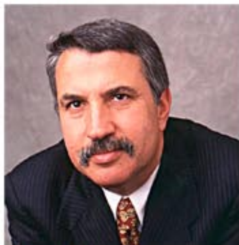
Thomas L. Friedman Op-Ed Columnist

Thomas Friedman's editorial in Monday's Peninsula Daily News answers my question with a call to action. In part he writes, "Whatever any of us does individually matters a tiny bit. But when leaders change the rules, you get scale change across the whole marketplace. And the energy-climate challenge we face today is a huge scale problem. Without scale, all you have is a green hobby."