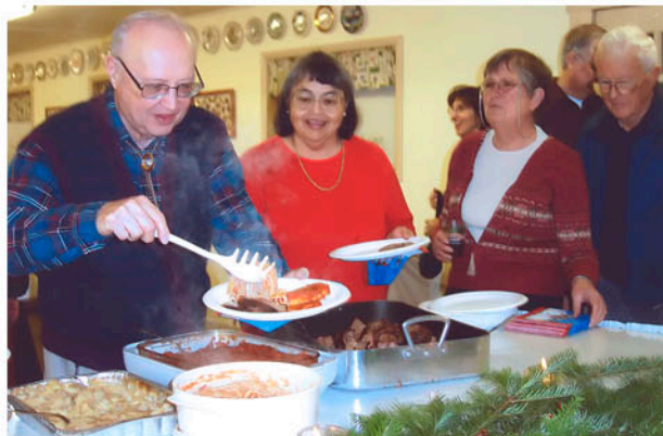
2006 Olympic Coast Discovery Center Holiday Party