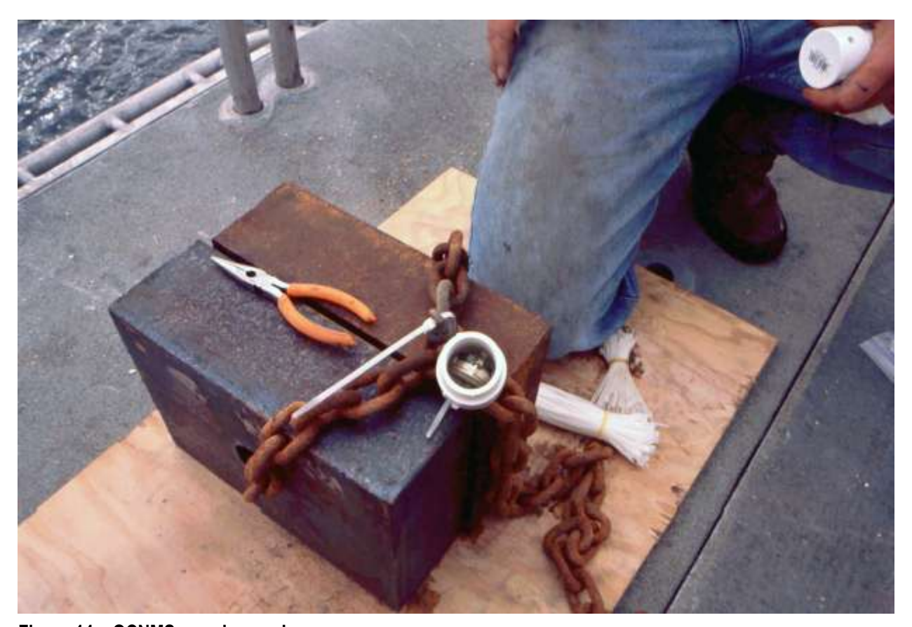
Figure 14 OCNMS mooring anchor

intervals. The organisms inhabiting the sediment sample normally are collected and analyzed, and they do not survive. While a few organisms may die, the overall populations of these organisms are not likely to be affected adversely because a minuscule area of the seafloor is sampled on an occasional basis.