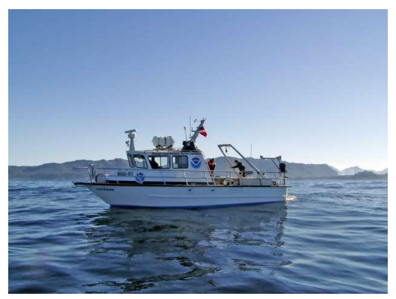
Figure 13 OCNMS Research Vessel Tatoosh

OCNMS staff operates a 38', diesel powered research vessel and a rigid-hull inflatable boat. OCNMS research and monitoring projects also involve the use of other NOAA or contracted vessels. OCNMS' RV Tatoosh (Figure 13) is occasionally used (no more than five times per year) for training, outreach and education activities (e.g., trips in the sanctuary for OCNMS volunteers). Additionally, the OCNMS vessels are occasionally used to investigate potential regulatory violations (less than five times per year, on average).