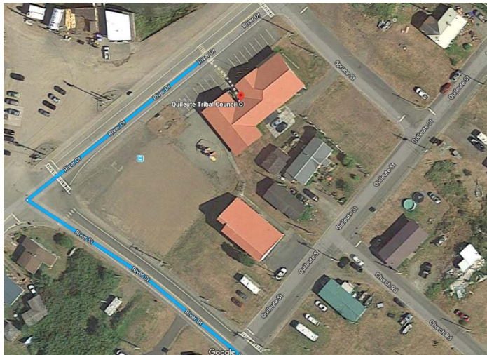
At "T", turn right on to River Dr. and right into Quileute Tribal Council parking